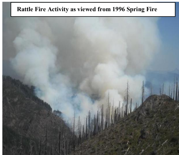
Rattle Fire Activity as viewed from 1996 Spring Fire

Due to the complexity, a new Type II management team was ordered (IMT2-3) and took over the fire two days later. On September 10, we were assigned to swing shift in order to conduct burnout operations as needed. We were assigned to Division A on our first shift. At 1245 I contacted Division A supervisor by radio where he instructed us to go to Pine Bench and construct handline downhill from Pine Bench to the road we were parked on. The weather that day showed possible winds from the NE 5-15 mph. Having had near misses on Pine Bench with snags coming down in the same conditions five days earlier, I had some concerns. I relayed my concerns over the radio to the division supervisor. There was already an IHC crew coming down from Pine Bench, so I instructed my crew to anchor off the road and build line uphill. Myself and one squad boss proceeded up the trail to Pine Bench.