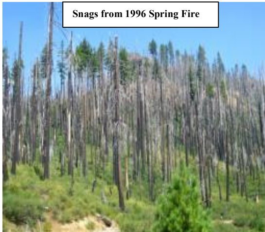
Snags from 1996 Spring Fire

On August 23, 2008, we were assigned to the Rattle Fire on the Umpqua National Forest in the Boulder Creek Wilderness. The fire was approximately 200 acres burning in a remote area inside the 1996 Spring Fire. At the time, IMT2-1 was managing the North Fork Fire on the North Umpqua RD and took over management of the Rattle Fire. Due to the location of the fire in steep, rugged terrain, and the extreme hazards posed by the burned snags that were still standing from the 1996 burn, the decision was made (by the team and the Forest) to construct indirect line to lessen the exposure of firefighters to the threat of the snags.